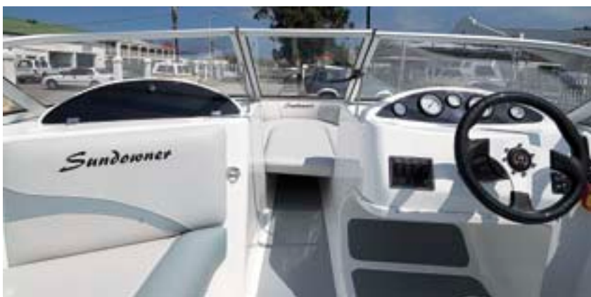
A walk-through Perspex windscreen separates the front area from the cockpit – this area is well-laid out, boasting loads of storage space, good legroom and plush seating.

to and from the boat, but also prevents passengers from getting their dirty feet all over your lovely cream upholstery. This eliminates the possibility of fitting a second outboard.