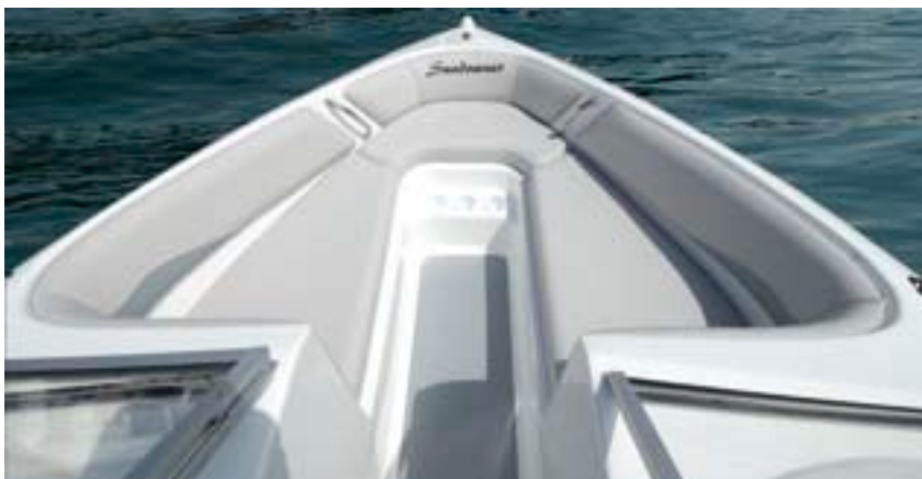
The craft's spacious bow area sports a filler cushion in the centre that transforms the area into a great place to be if you want to work on that neglected tan.

A walkthrough step on both sides of the transom not only provides easy entry