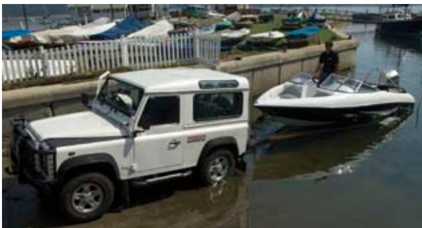
Honda Marine's diesel 4x4 tow vehicle made light work of the craft and got her into the water within 10 minutes – a real joy to tow, launch and retrieve.

Firstly, he towed the trailer and reversed it onto the slipway with his diesel-powered 4x4, which seemed to handle the load with ease. He then unhooked it from the winch and slid it off the bearers and into the water, within a matter of a few minutes.