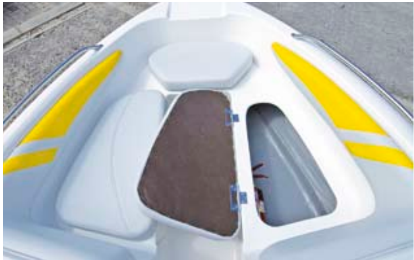
The Legacy 17 is a bow rider and her roomy front section offers sufficient space for seating as well as for storage.

With a maximum horsepower rating of 135, she's more than capable of towing a heavy-set skier at a blistering pace. So when you see a yellow bolt of lightning on a dam near you, look for the logo, it'll probably read: LEGACY.