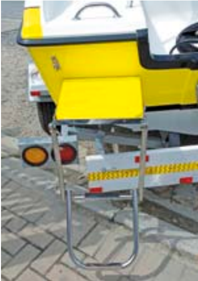
A three-step telescopic ladder at the stern makes boarding and disembarking easy.