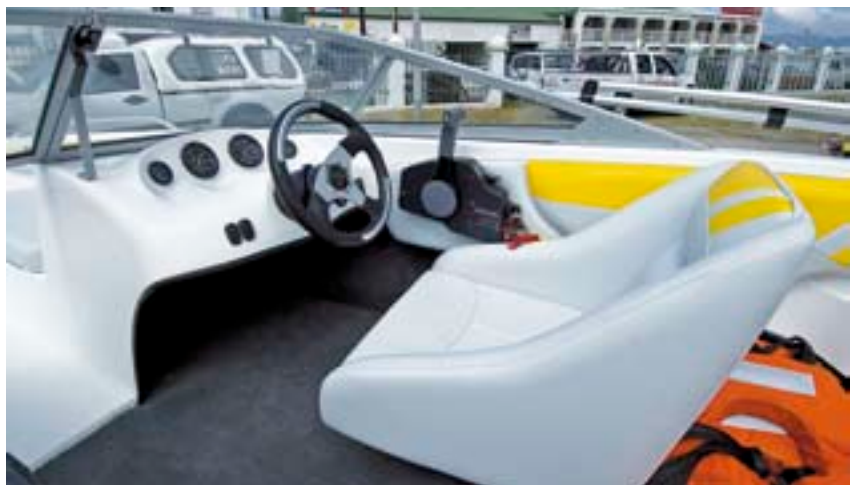
Sexy instrumentation, comfortable bucket seats and hydraulic steering makes the Legacy 17's helm area a dream for any skipper.