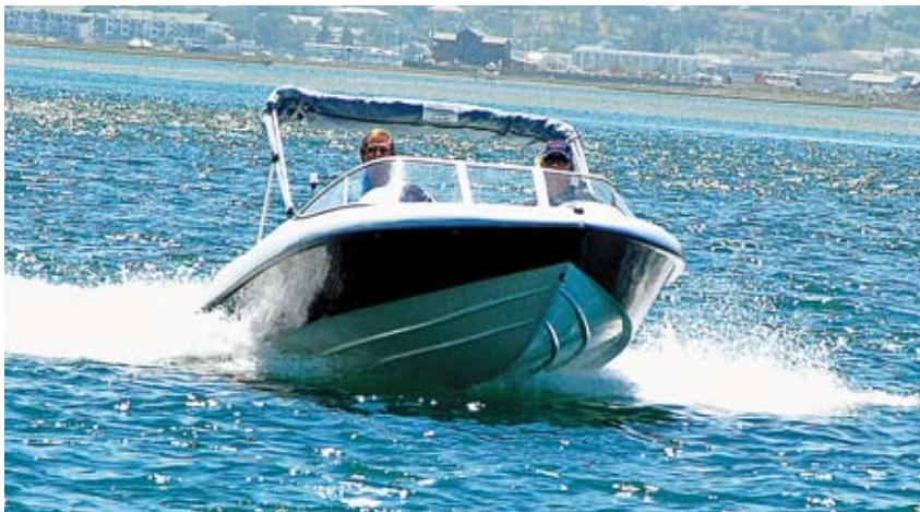
Built to thrive on speed, the craft's semi-deep V hull handled the choppy surface with the greatest of ease.

We managed a top speed of 78 km/h @ 6 200 rpm, which seems more than adequate for family boating.