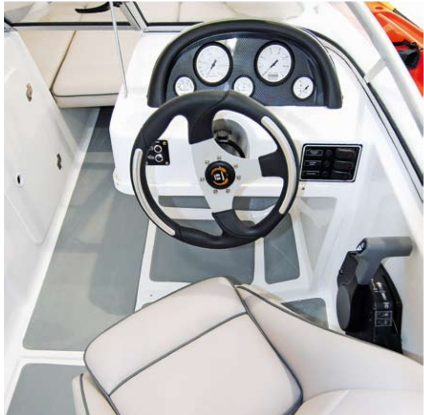
The helm houses analogue instrumentation, putting a wealth of information at your fingertips.

the wind and separates the bow from the main cockpit. The craft's helm station houses analogue instrumentation, keeping you informed as to mph, rpm, volts, fuel and trim, as well as a switch panel for controls to both anchor and running lights.