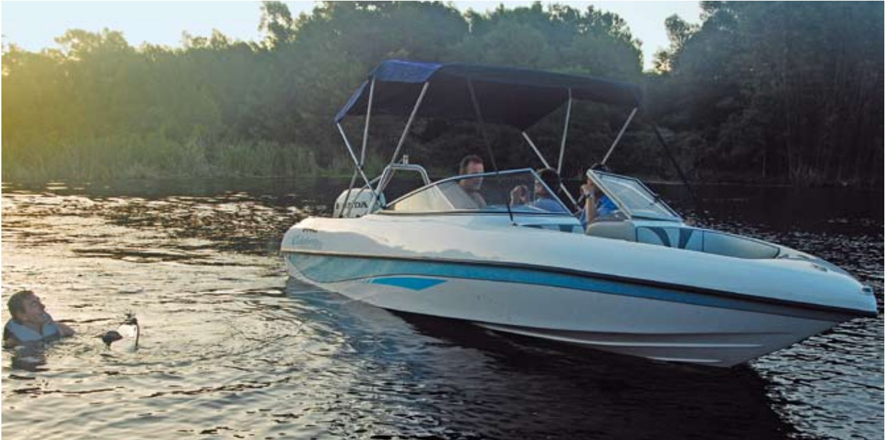
Although very easy on the eye, the Celebrity 210 is definitely not a case of more style than substance.

Being on the Celebrity 210, I couldn't help but notice striking similarities that exist between this boat and some famous high-performance cars. For instance, the craft's powerful Honda 200 HP four-stroke engine purrs like a Porsche's; its silky-smooth responsiveness reminds me of a Ferrari's; and the boat's exquisite interior is as sleek and stylish as that of a Rolls Royce.