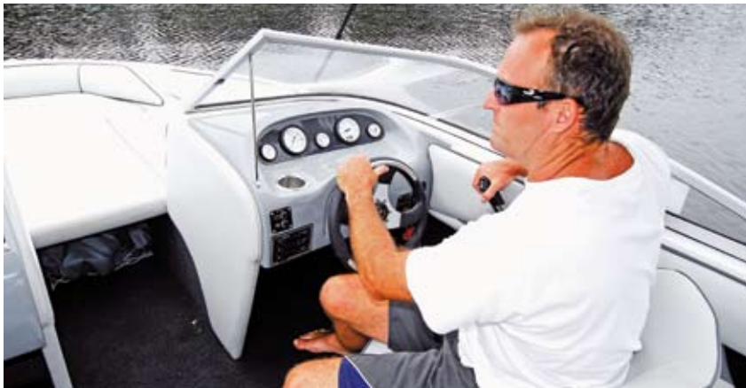
The dashboard shows that elegance and functionality can work together – perfectly.

clean, sleek and uncluttered speedboat. If Bond were currently in the market for a boat, you can bet for sure that he'd opt for the Celeb 210 – it would suit his suave personality and lifestyle perfectly.