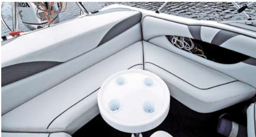
The removable table is flanked by comfortable seating, making this the ideal socialising spot.

A useful and convenient feature is the small removable cocktail table, complete with four cupholders, at the stern of the boat. The stern seating surrounds it, making this area perfect for socialising with friends and family.