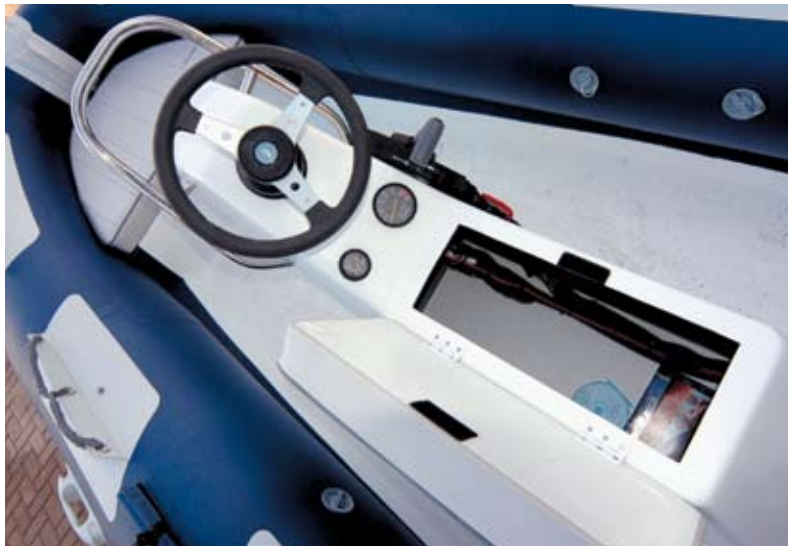
Strong, sturdy and simple, the RIB 450 leaves little room for improvement.

Depending on how far you're travelling and how much you value your personal space and comfort, you can apparently fit up to seven people on board this boat. I wouldn't recommend it though. I don't like to be squashed on a boat, and would stick to four or five at a time. With seven people on board you'd also struggle for storage space, but by reducing the number of passengers you'll be pleasantly surprised by the amount of packing room ▶