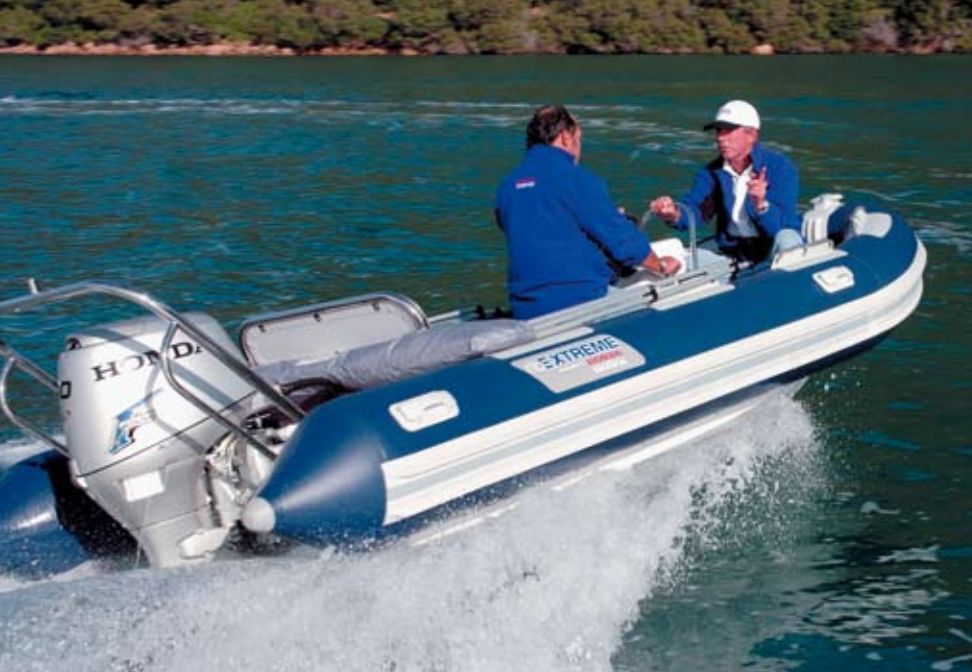
Pontoons are made of German Valmex and all seams are thermo-bonded.

provided. The skipper gets a centre console and cushioned seat from which to pilot the craft. Steering is standard cable, and gauges include rpm and trim. The 450 also comes with a convenient stainless steel boarding ladder and useful sun canopy. What's more, she couldn't be easier to tow, launch or retrieve. Simply pop her into the water and hit the surf. I'm not sure how much it says for my social life, but it's the most fun I've had in a while!